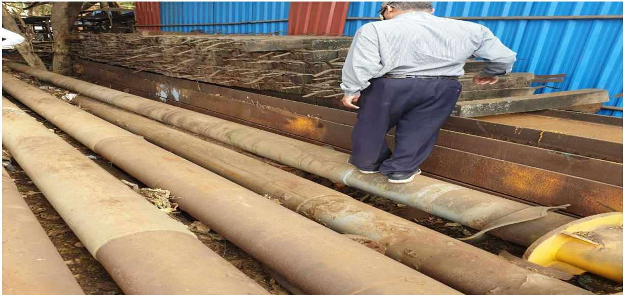
MONEL METAL CLADDING OVER J TUBES, ANODES & BEAMS