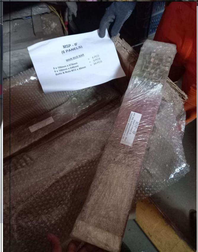
BUS BAR DETAIL