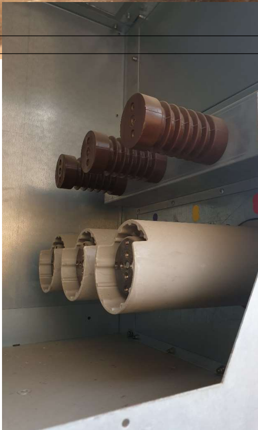
CURCUIT BREAKER IN PANEL