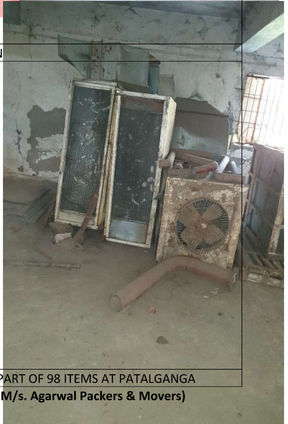
ELECTRICAL PANELS INSIDE E ROOM