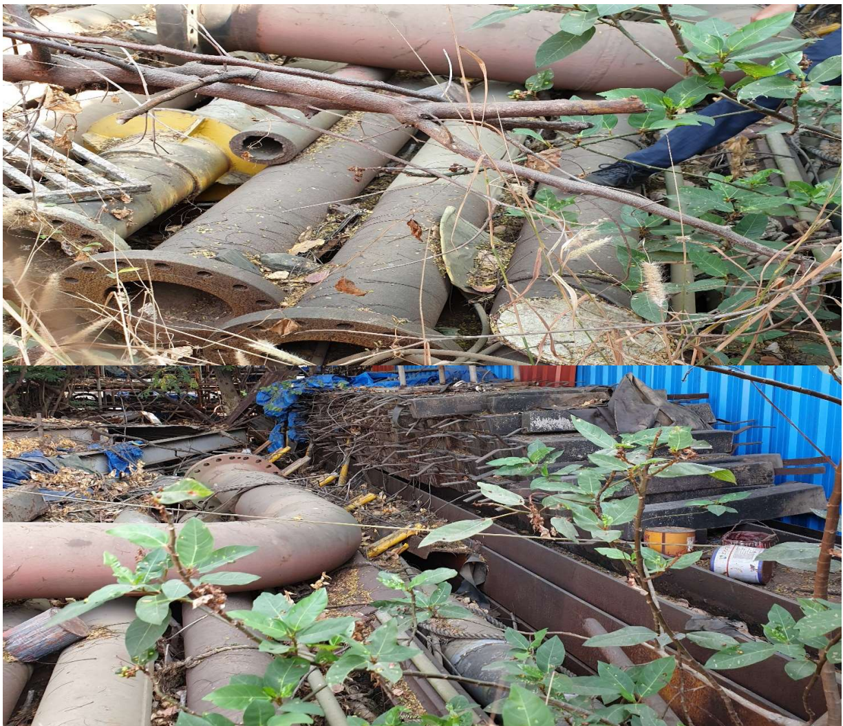
MATERIAL STACK BEFORE SEGGERATION (Pictures at M/s. Das offshore )